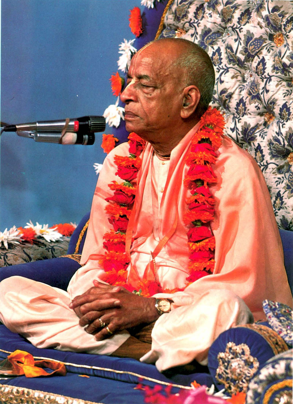
His Divine Grace A. C. Bhaktivedanta Swami Prabhupāda Founder-Ācārya of the International Society for Krishna Consciousness