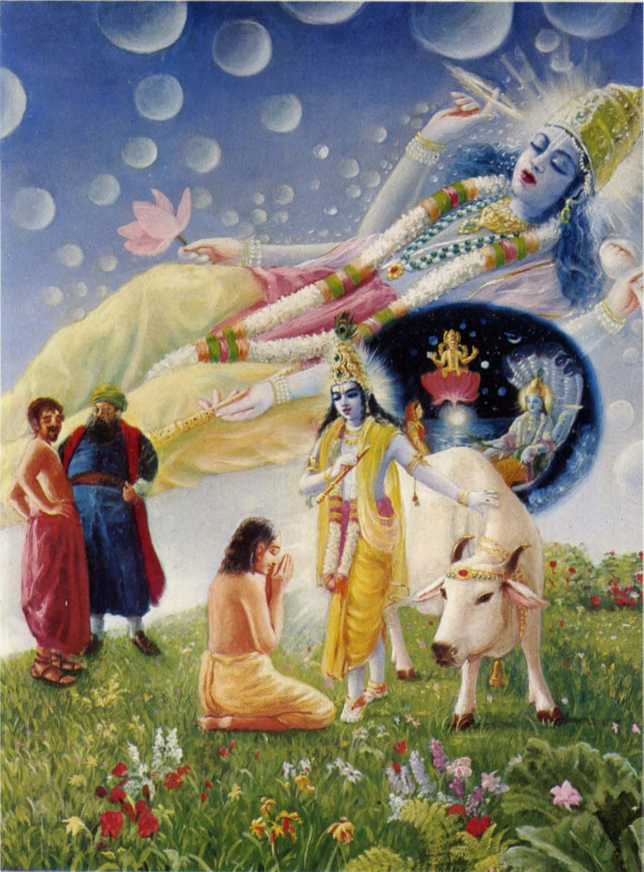
Plate 5 The Supreme Lord is transcendental to this material world; therefore only a fool thinks of Him as an ordinary human being. (p. 477)