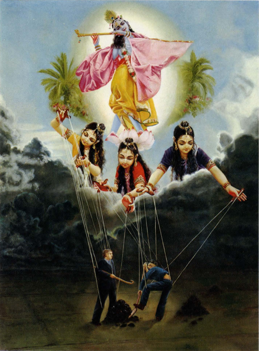
Plate 2 "You are eternally the master of the three modes of material nature; thus You are always different from the ordinary living entities." (p. 382)