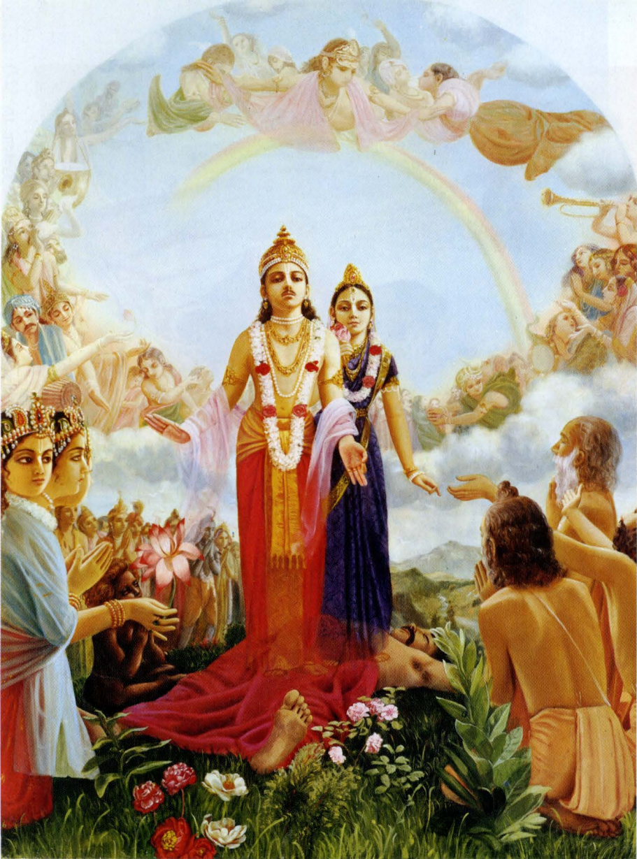
Plate 7 The male and female born of the arms of Vena's body were an expansion of Viṣṇu, the Supreme Personality of Godhead. (p. 622)