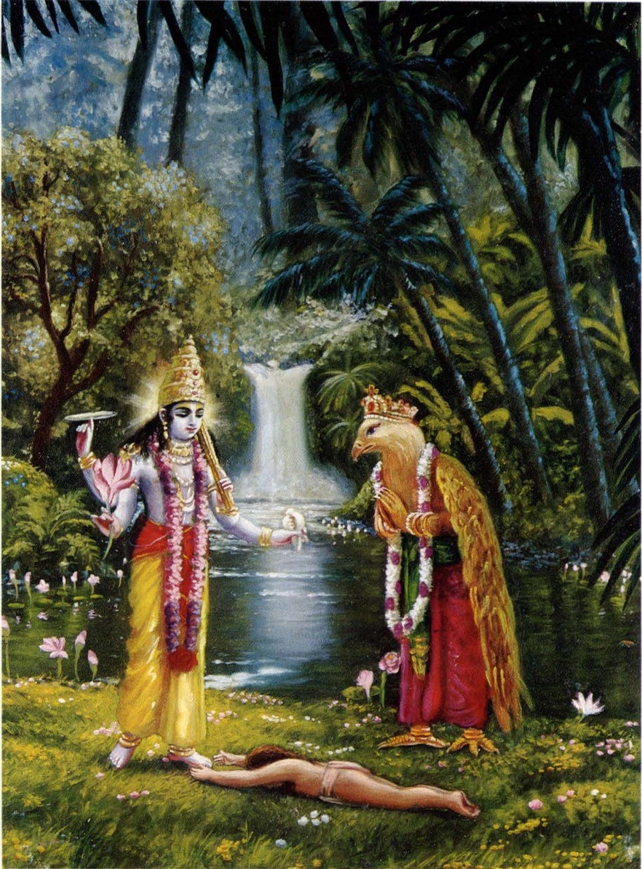
Plate 1 Dhruva fell flat before the Lord like a rod and became absorbed in love of God. (p. 363)