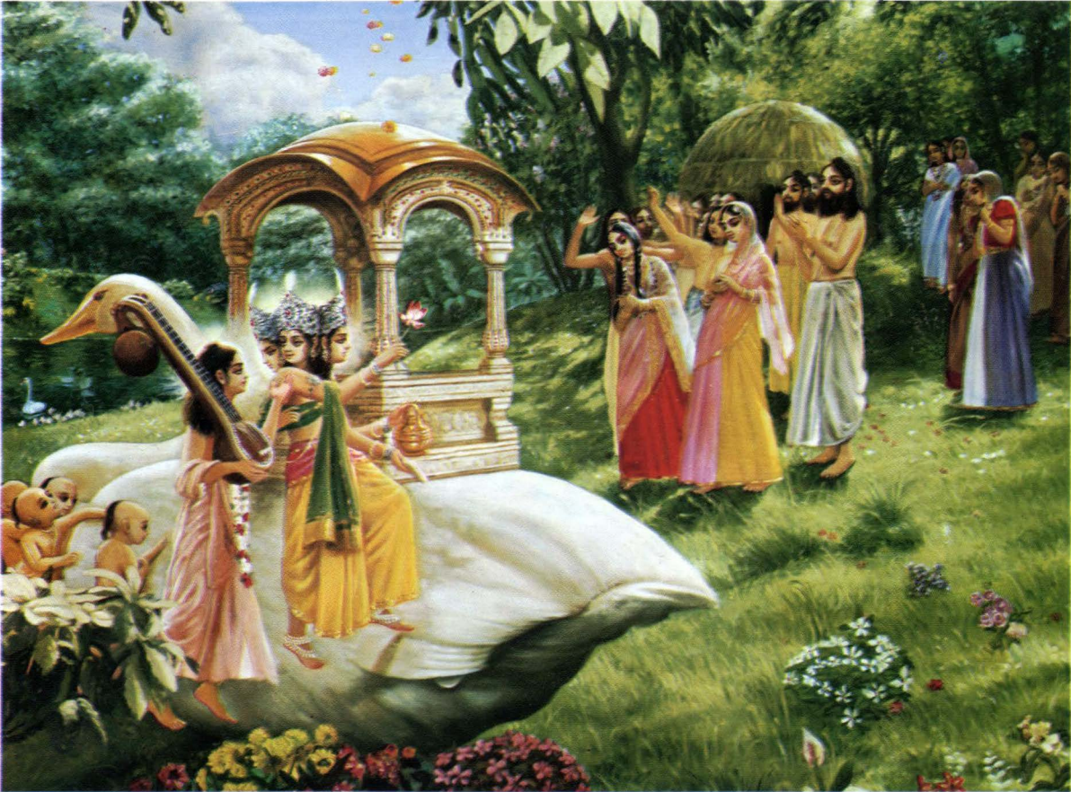
Plate 6 After speaking to Kardama Muni and Devahūti, Lord Brahmā left for his abode. (p. 970)