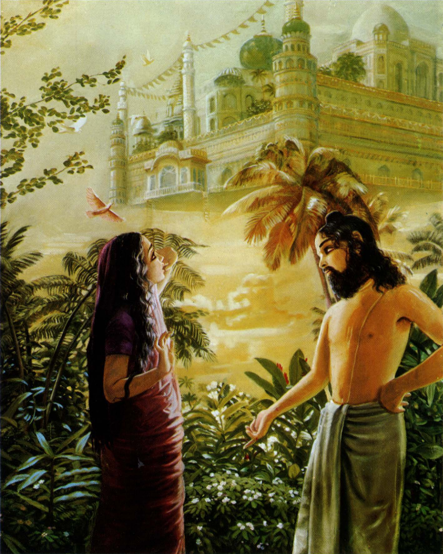
Plate 4 The sage Kardama instantly produced an aerial mansion by his yogic power. (p. 915)