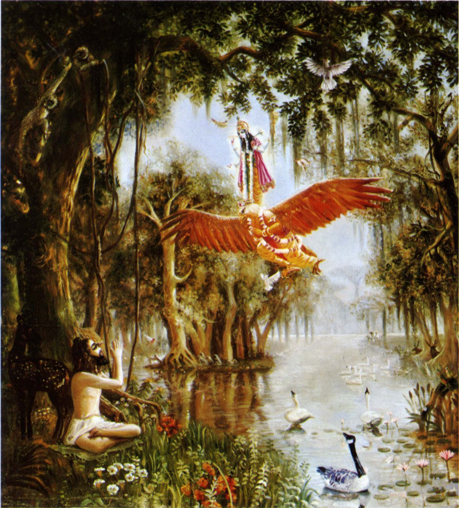
Plate 3 The Lord appeared before Kardama Muni with His lotus feet placed on the shoulders of Garuda. (p. 810)