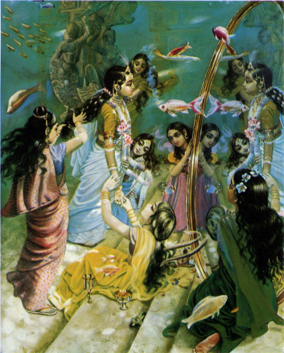
Plate 5 The girls very respectfully bathed Devahūti with valuable oils and ointments. (p. 925)