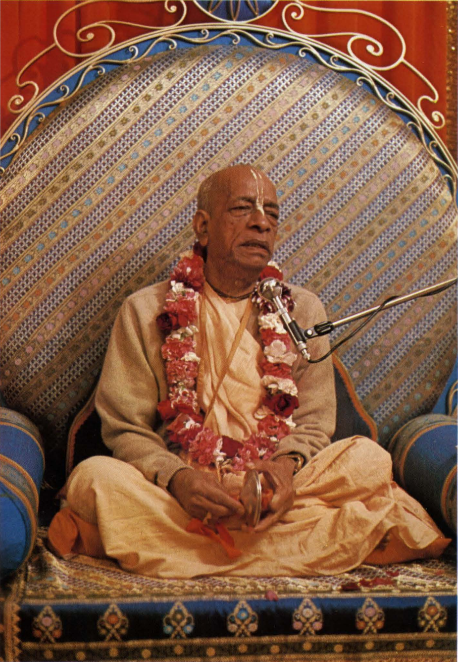
His Divine Grace A.C. Bhaktivedanta Swami Prabhupāda Founder-Ācārya of the International Society for Krishna Consciousness