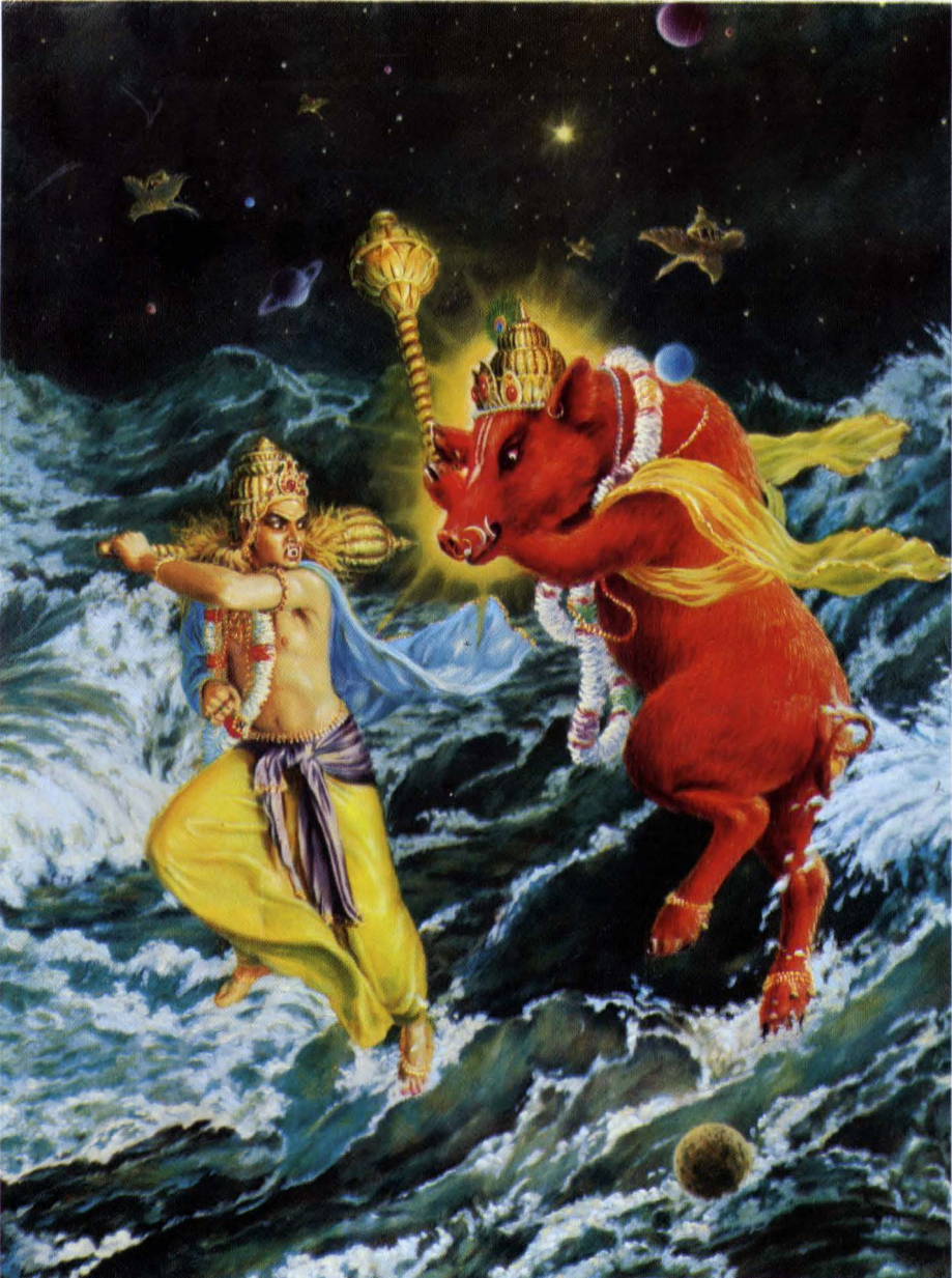
Plate 1 The demon and the Lord struck each other with their huge maces, each enraged and seeking his own victory. (p. 715)