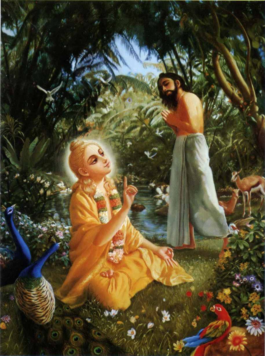
Plate 7 "O Muni, because I told you before that I would become your son, I have descended to fulfill this truth." (p. 984)