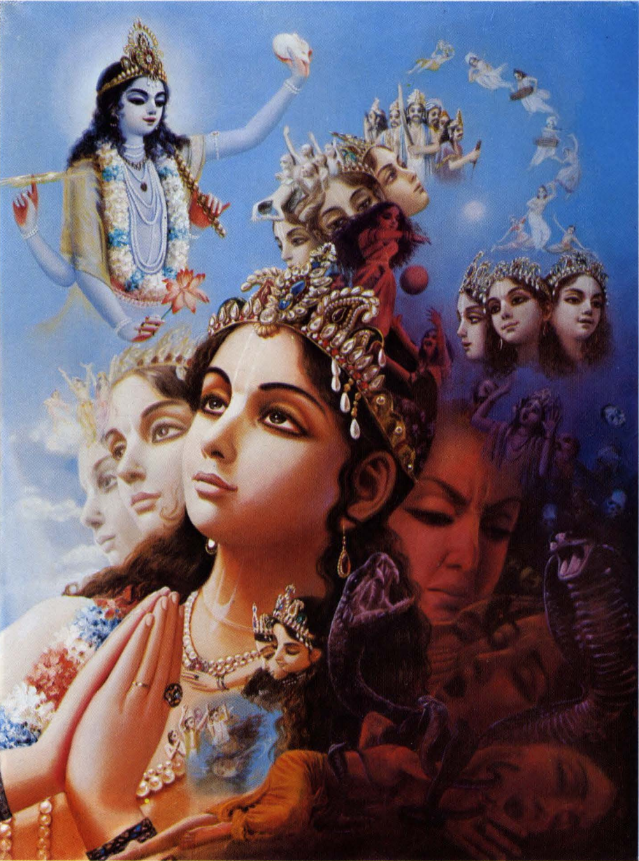
Plate 2 On the order of the Supreme Lord, Brahmā cast off his impure body. (p. 779)