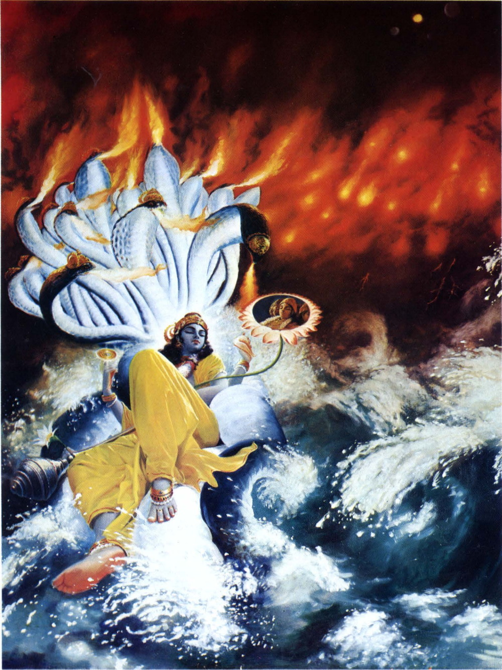
Plate 3 The devastation takes place due to the blazing fire emanating from the mouth of Sankarṣana, the serpent bed of Lord Viṣṇu. (p. 429)