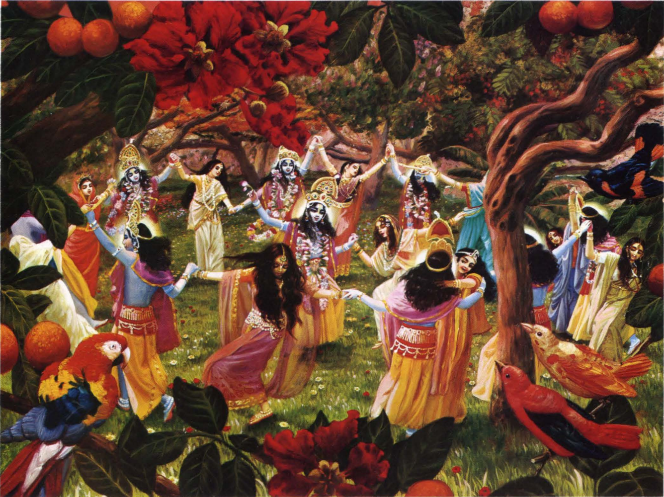
Plate 1 Lord Kṛṣṇa performs the rāsa dance in the company of the cowherd girls of Vṛndāvana. (p. 352)