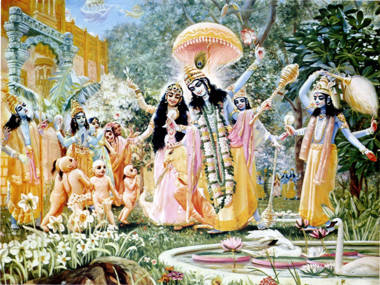
Plate 7 The sages saw that the Supreme Personality of Godhead, Viṣṇu, had now actually become visible to their eyes. (p. 614)