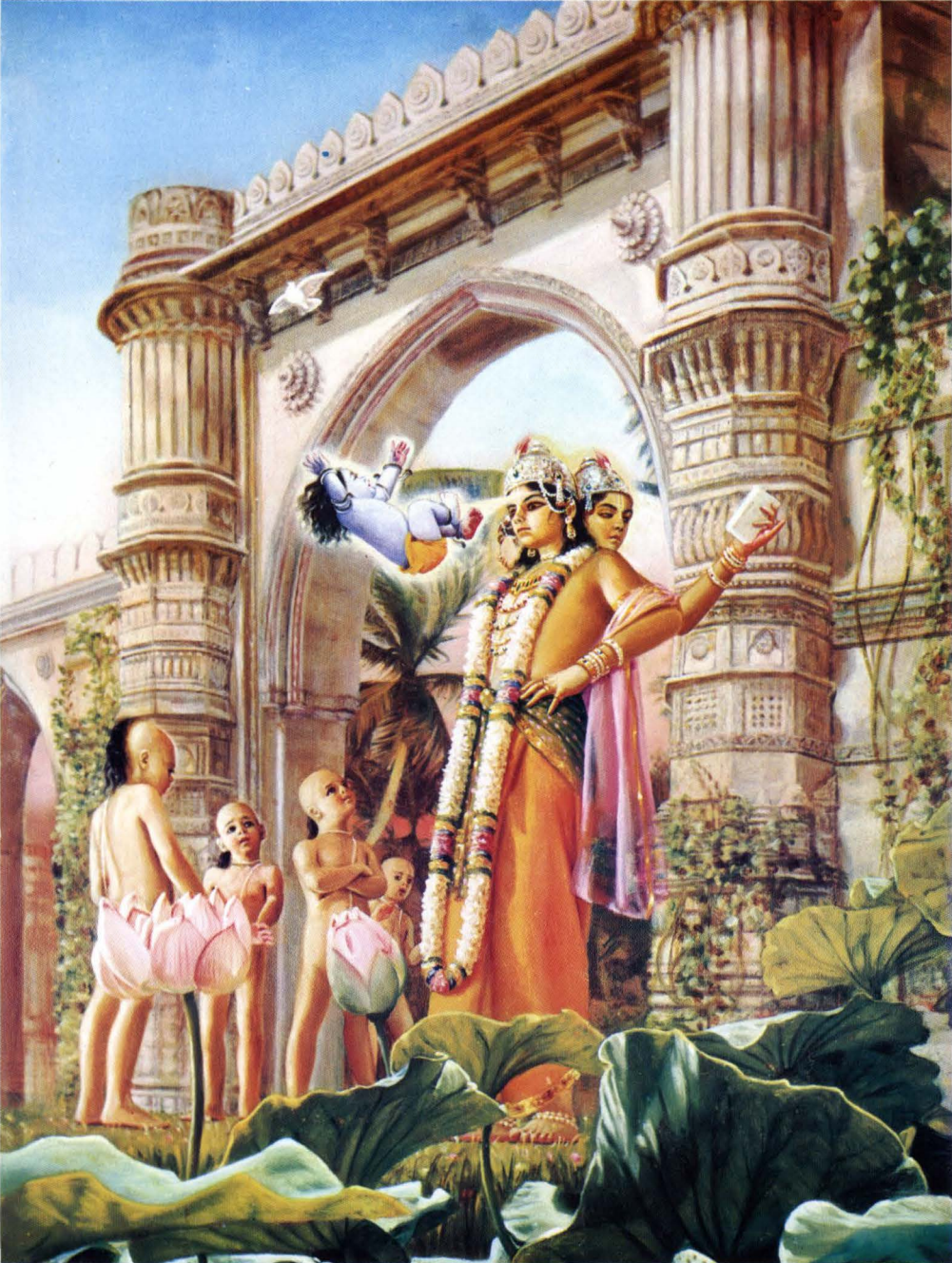
Plate 4 "Although he tried to curb his anger, it came out from between his eyebrows, and a child of mixed blue and red was immediately generated." (p. 447)