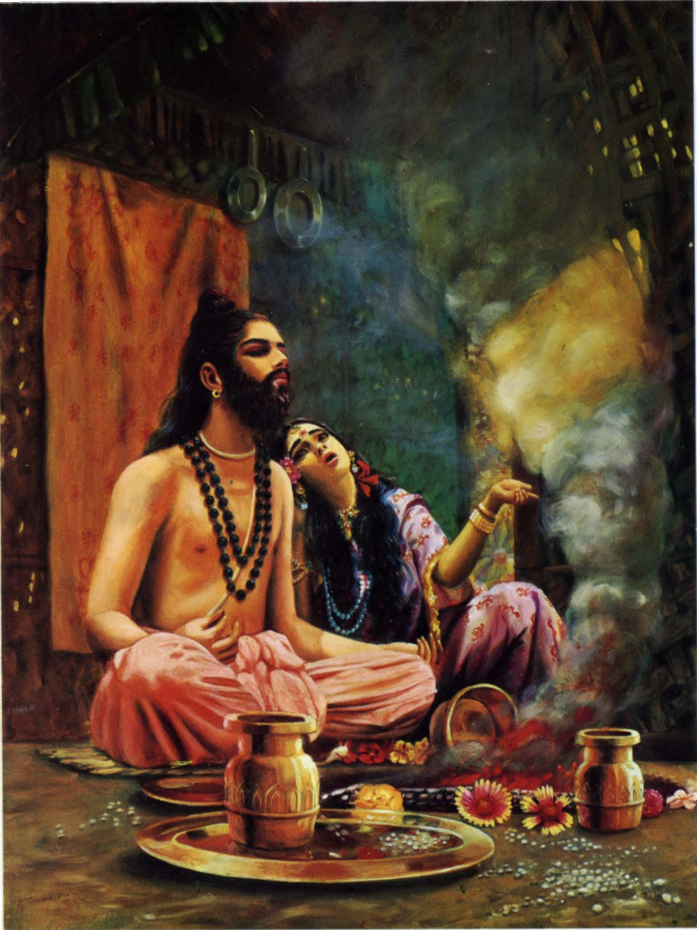
Plate 6 Beautiful Diti, seeing her husband absorbed in trance, frankly expressed her lustful desires. (p. 537)