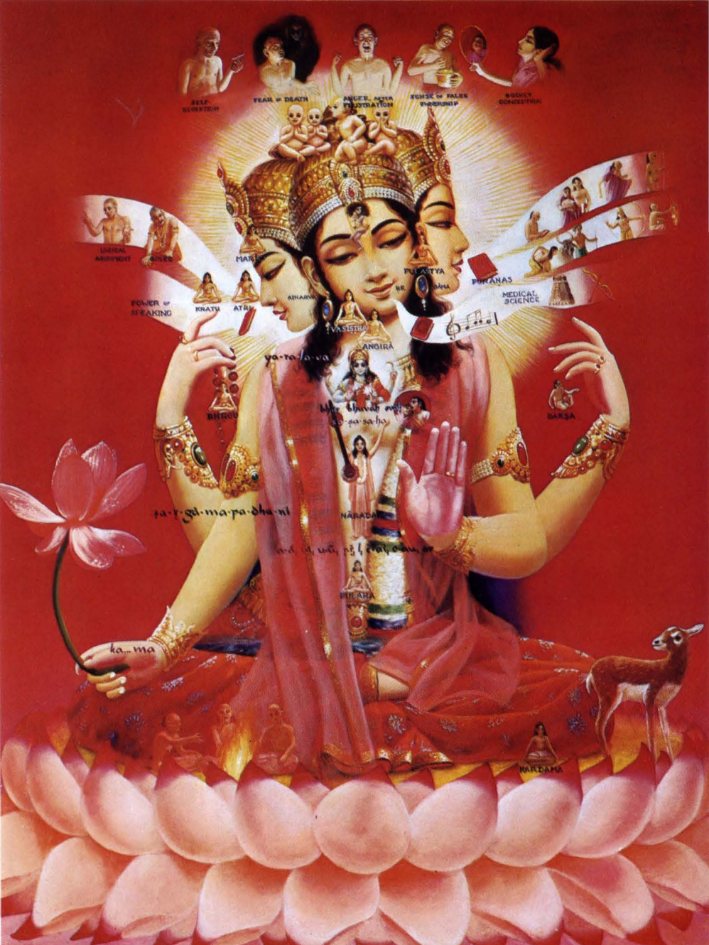
Plate 5 Creation of the universe by Lord Brahmā, the great grandfather of all living beings. (pp. 441-478)